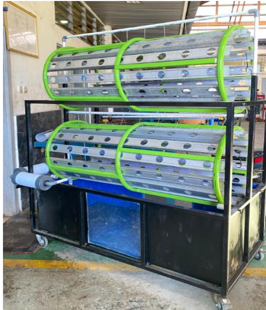
Fig 2. Prototype of a double-rotary-table-based aquaponics system following fabrication

The design of a double-rotary-table-based aquaponic system was successfully implemented in a compact, integrated mechanical configuration, as shown in Figure 2. The system combines fish and plant cultivation units in a single closed-loop circulation cycle with a tank capacity of 507.76 L, designed to maintain a balance between water volume, fish requirements, and nutrient supply for the plants. The main structure uses ST37 steel, which provides adequate mechanical strength and maintains system stability during operation. The two-cylinder rotating configuration allows for more efficient use of vertical space compared to conventional static systems.